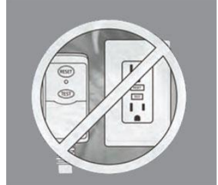
For details about starting and maintaining the spa, be sure to check the <u>user's guide.</u>

The spa is equipped with a 15' wire (3' inside and 12' outside). It's a GFCI-protected wire cord with a reset button ready to plug into a standard 120V electrical socket. DO NOT PLUG INTO A GFI RECEPTACLE OR USE WITH AN EXTENSION.