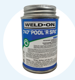
PVC 747 Weld-ON Glue (118 ml #112-W12725WEL or 237 ml #105-0508)