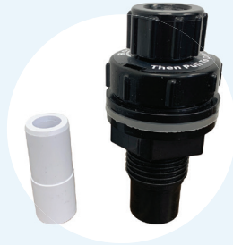
1 drain assembly (Part # 300-0233)