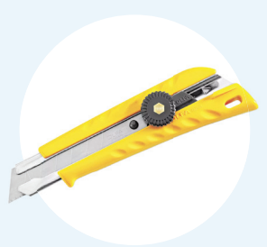
1 utility knife (box cutter) or pipe cutter (Part # 137-HD-PVC-CUTTER2CE or 137-HOSECUTTERSCEN)